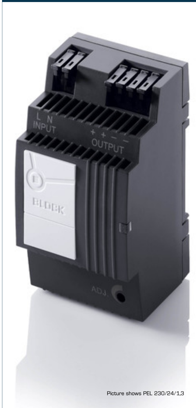
Picture shows PEL 230/24/1,3